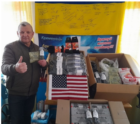
Ukrainian doctor helping distribute supplies

In partnership with Ukrainian Cultural Association of Ohio (UCAO), we were able to send supplies to Ukraine to help with Frontline Medical – including Bombas socks (from our Socktober effort). Black socks will be distributed to medics, and the white socks will be distributed to wives of defenders.